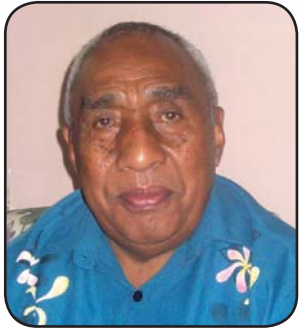
Osipate Tuicakau, ROKO TUI KADAVU

According to an early description, (Domodomo, Fiji Museum, J.P. Thomson), the people of Kadavu are "...vivacious, kind, obliging, courteous and hospitable ...sense of justice, and discourage acts of dishonour". "... ..keen traders and like to obtain full value for their goods, ...petty quarrelling, jealousy, division, and dissension are uncommon..."