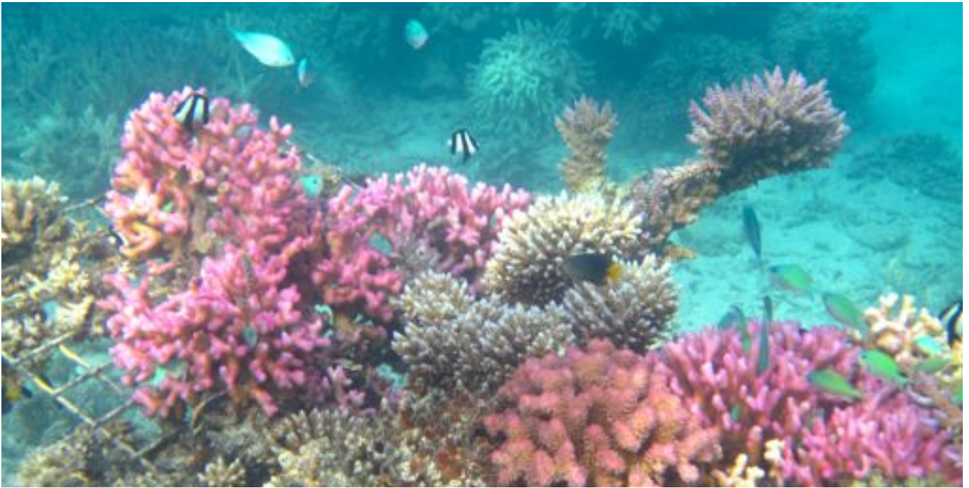
PCDF coral tables installed by members of the NRM team. Located offshore of Moturiki, as featured in the Annual Report 2010.