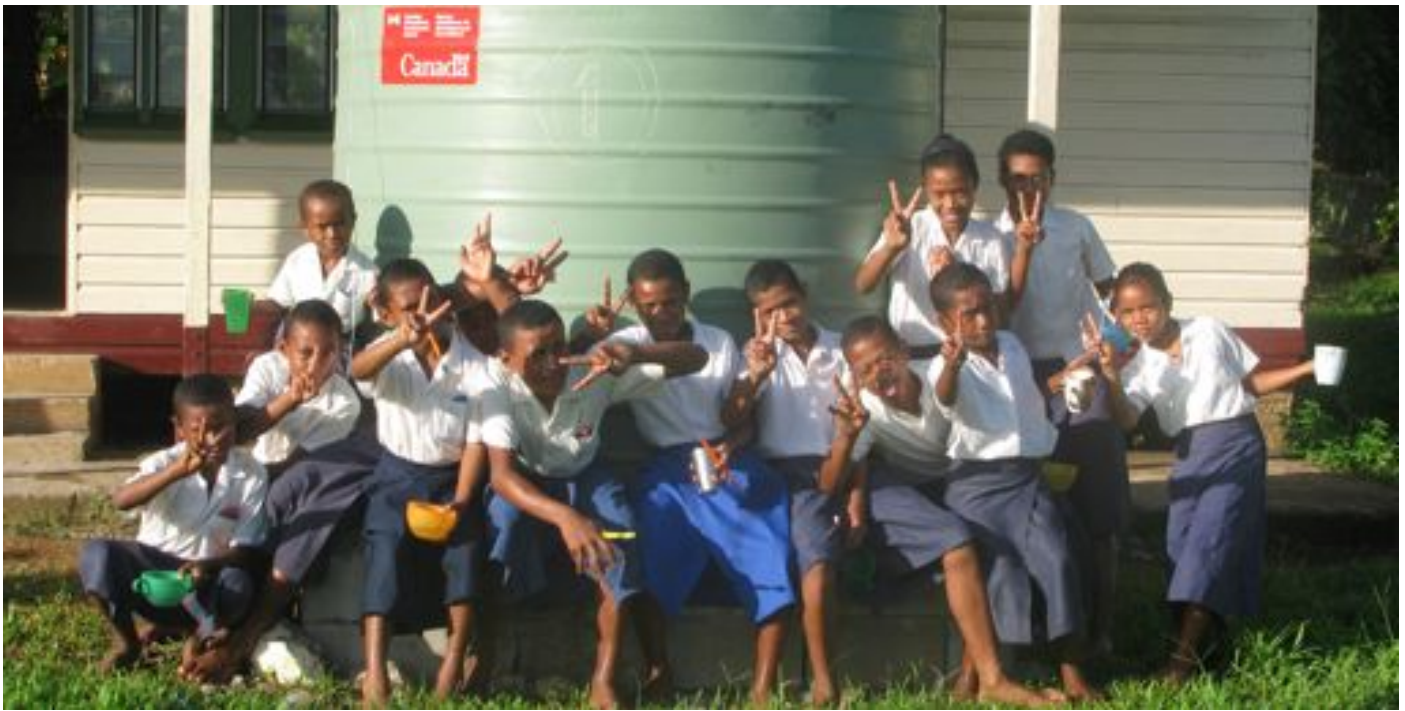
Uciwai Primary School students pose with their new water tank. Previously, students were required to bring their own drinking water from home