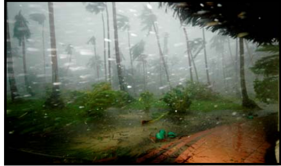
Images taken during the cyclone, Serua District, Viti Levu.

Website: www.pcdfiji.org or www.pcdf.org.fj