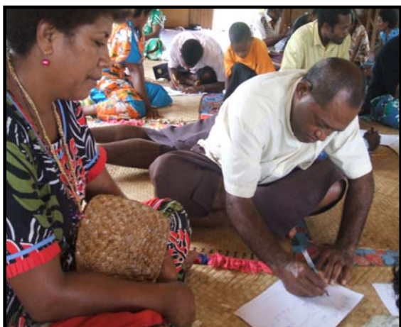
A working group in Namalata, Kubulau, Bua

Iliapi went to Vanua Levu to deliver farm tools Keka village in Wailevu District. The farming tools were requested by the youth group as their income generating project.