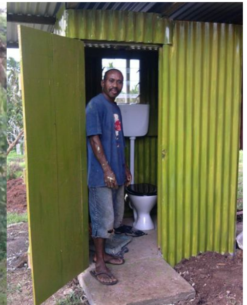
Before and after: The previous pit toilet and new flush toilet in Nadivakarua village, Kubulau

grateful to MORDI for giving this project to us. We approached many organisations beforehand but eventually MORDI were the only ones who offered to help us - this will benefit generations to come."