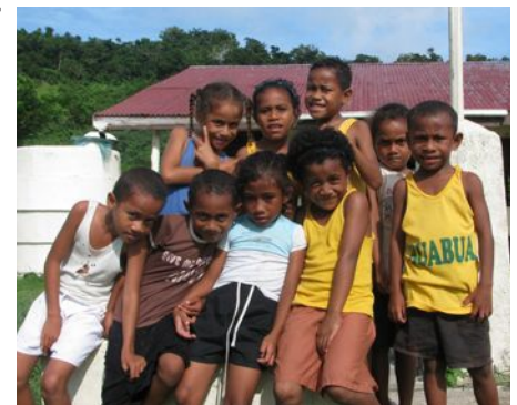
The children of Cicia are eagerly awaiting the new books

The generous donation was made possible by the kindness of two New Zealand citizens with the support of six Bay of Plenty primary schools.