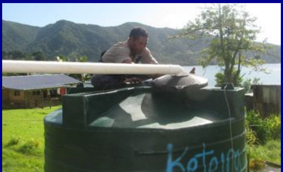
Reinforcing the strainer on the water tank in Keteira village.