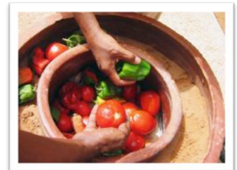
A traditional Zeer pot

Several of the pots will be provided to the Batiki and Moturiki schools and then be introduced to the pottery community of Serua for income-generating projects.