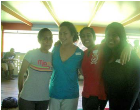
Youth volunteers at the safetalk suicide prevention work shop

• Youth Champs. 17 Youth Champ volunteers received Safetalk suicide prevention training.