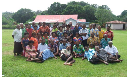
Namalata Good Governance and Leadership workshop

• The Good Governance and Leadership workshop has been conducted at Namalata with a total of 56 participants.