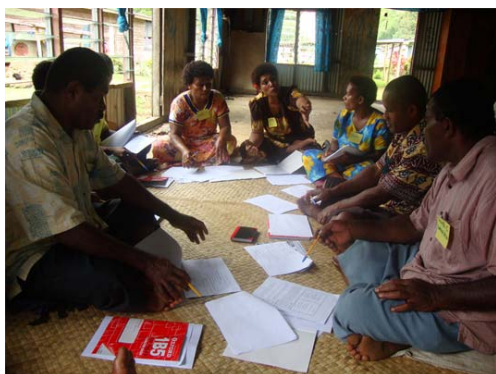
Participants of the disaster management and first aid training