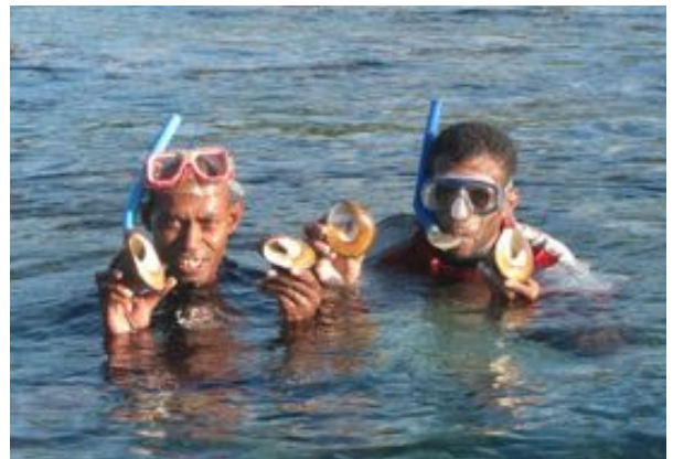
Screening the Yanuca Marine Protected Area

From June 6th-7th, members of the NRM team spent time in Serua District to complete the installation of Yanuca's Marine Protected Area (MPA) markers. The markers demarcate the territory where marine life is protected to replenish natural resources.