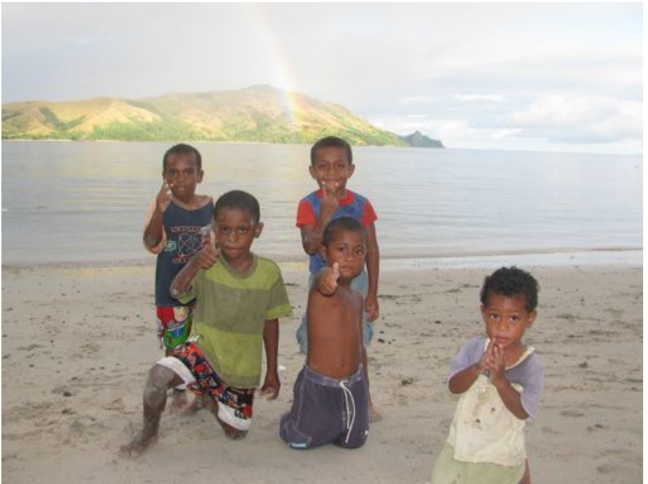
Top left: Workshop participants engaging in group work