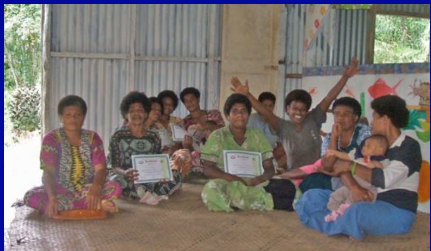
Above: Members of the Women's Group Right: One of the sewing machines

The initiative has had many side benefits, for example children's