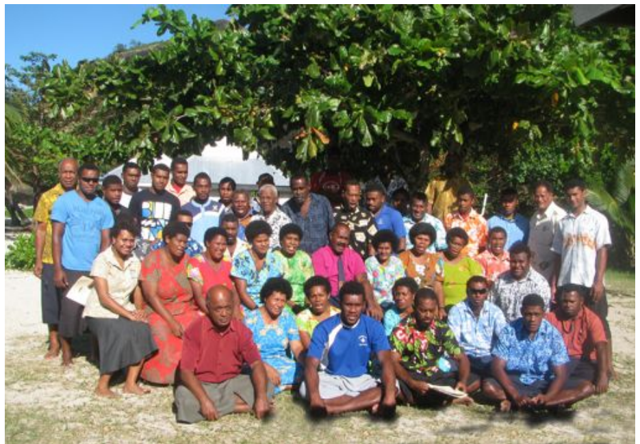
Top: Yalobi village on Waya island, where the workshop took place