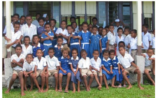
School students of Mabula Primary School, Cicia Island

Suva, Fiji – A book donation drive has been launched in aid of five community schools of Cicia island in Lau. The initiative was started by PCDF in affiliation with the Young Professionals (YPs) Club of YWCA Fiji.