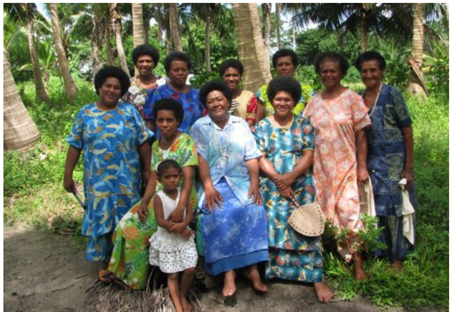
Top: A view of Mabula village, the biggest village in Cicia with a total population of 398.